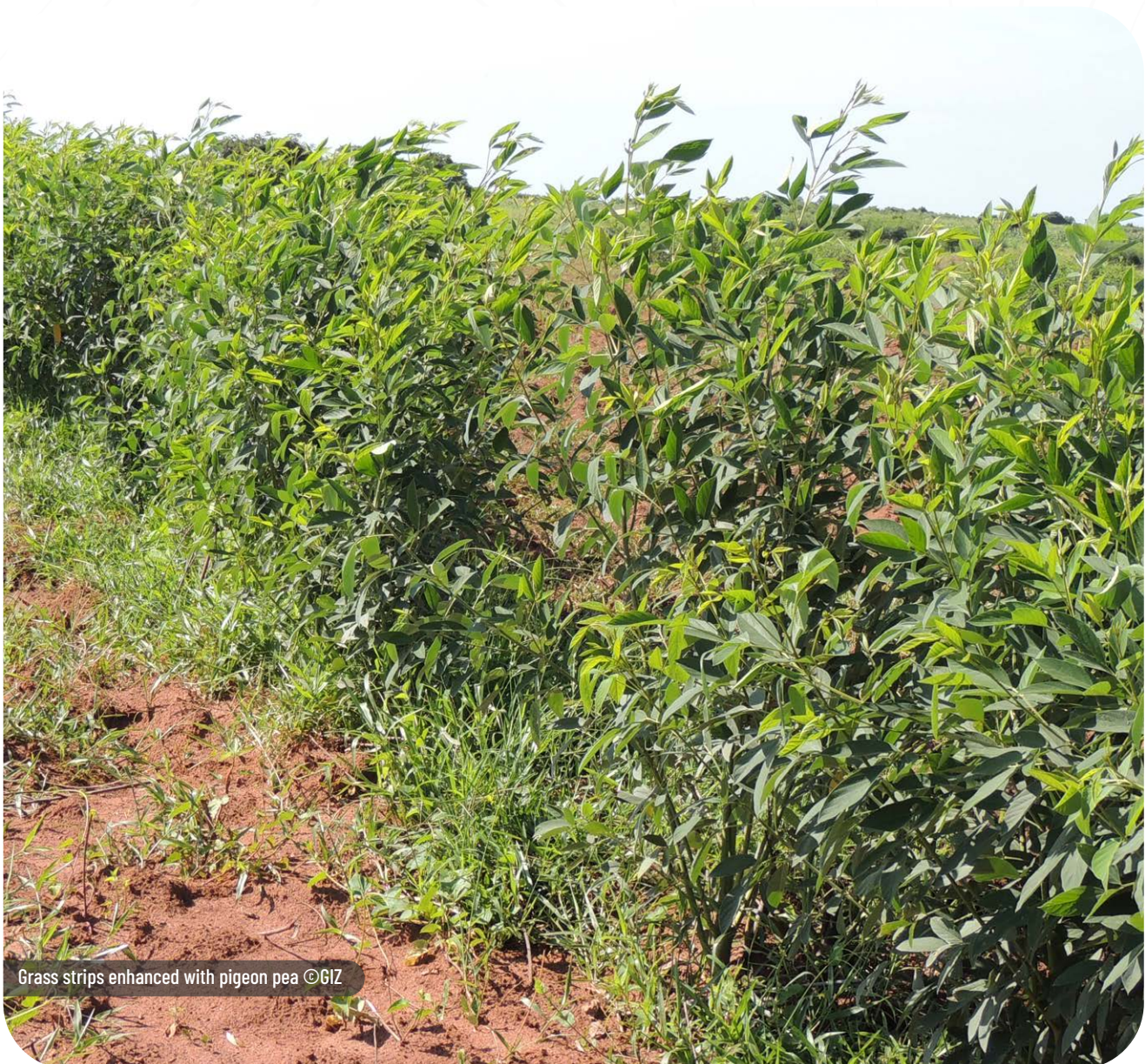
Grass strips enhanced with pigeon pea

Last but not least, I hope this publication motivates other decision makers to improve land management through the inclusion of pulses and legumes and, consequently, enhance nutritional outcome of agriculture while safeguarding natural resources.