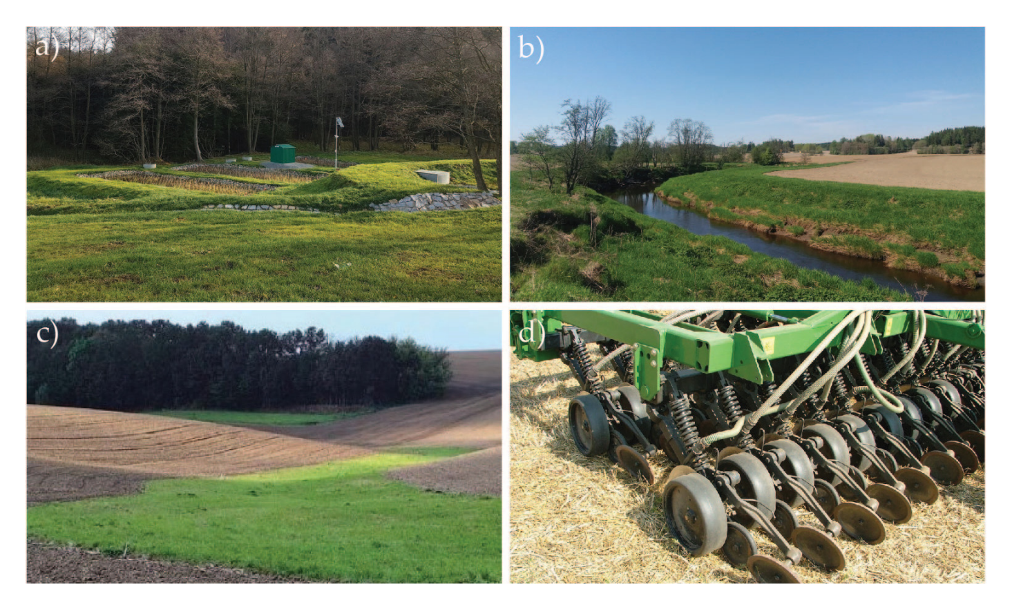
Figure 1. Examples of NSWRM in OPTAIN [13]. (a) Experimental retention wetland [14]; (b) river buffer zones [15]; (c) grassed waterway [16]; (d) direct driller machine for reduced tillage agriculture [17].

All these ecosystem-based concepts address the human use of nature or natural functions and ecosystem services, defined as "the benefits people obtain from ecosystems" [18], and their associated multifunctionality. Each has been developed by different actors and articulated in different frameworks for various specific objectives at different times. It is hardly surprising, therefore, that there is considerable overlap. While the variety in terminology may appear confusing, we aim to show that this wide diversity is, in fact, valuable to help place the overarching idea of ecosystem-based concepts into practice in a structured and targeted way. We demonstrate that the different concepts address this broad goal from different angles, helping each sector or thematic actor to take part in using nature more effectively, or restoring natural functions for their designated purposes.