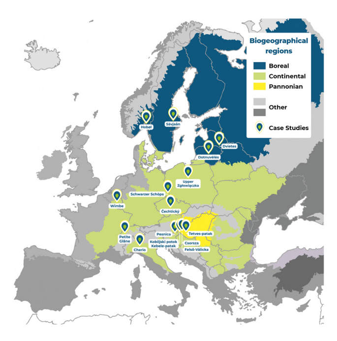
Figure 2. Biogeographical regions covered by the OPTAIN project (boreal, continental, Pannonian) and location of the 14 case studies. European Environment Agency base map [54] with grey-scale colouring for the biogeographical regions not addressed in OPTAIN ('other').